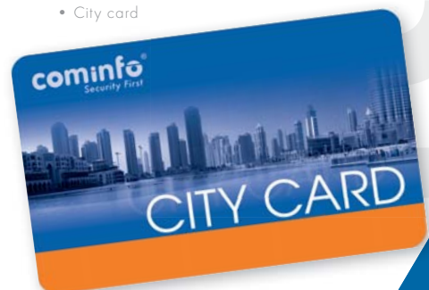
• City card