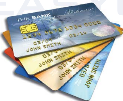
• Visa/MasterCard contactless